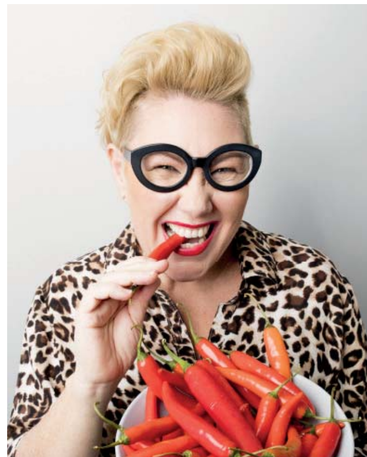
STEPH DE SOUSA The Air Fryer Queen 📷 899K | 📺 372K