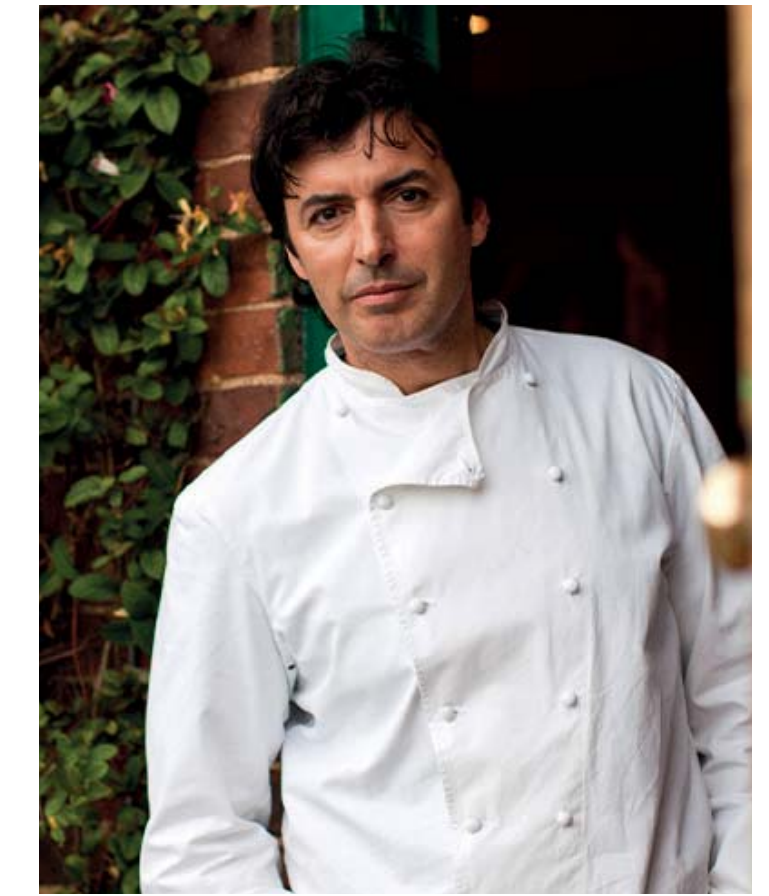
JEAN CHRISTOPHE NOVELLI Michelin Starred Chef 📷 69.4K | 📺 6.7K | 📺 13.7K