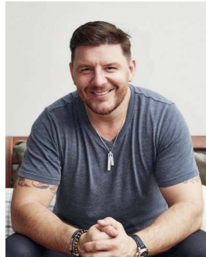
MANU FEILDEL Host of My Kitchen Rules, Australia 📷 200K | 📺 269K