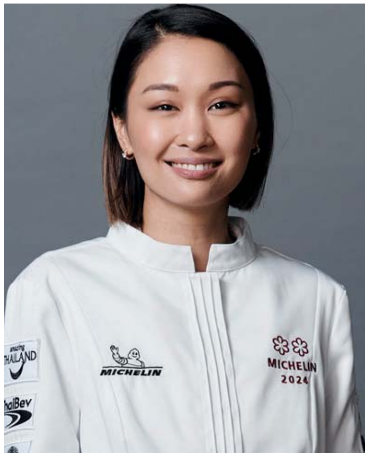
TAM CHUDAREE DEBHAKAM Chef, Restaurateur, First Thai female with 2 Michelin Stars @33K | 9.6K