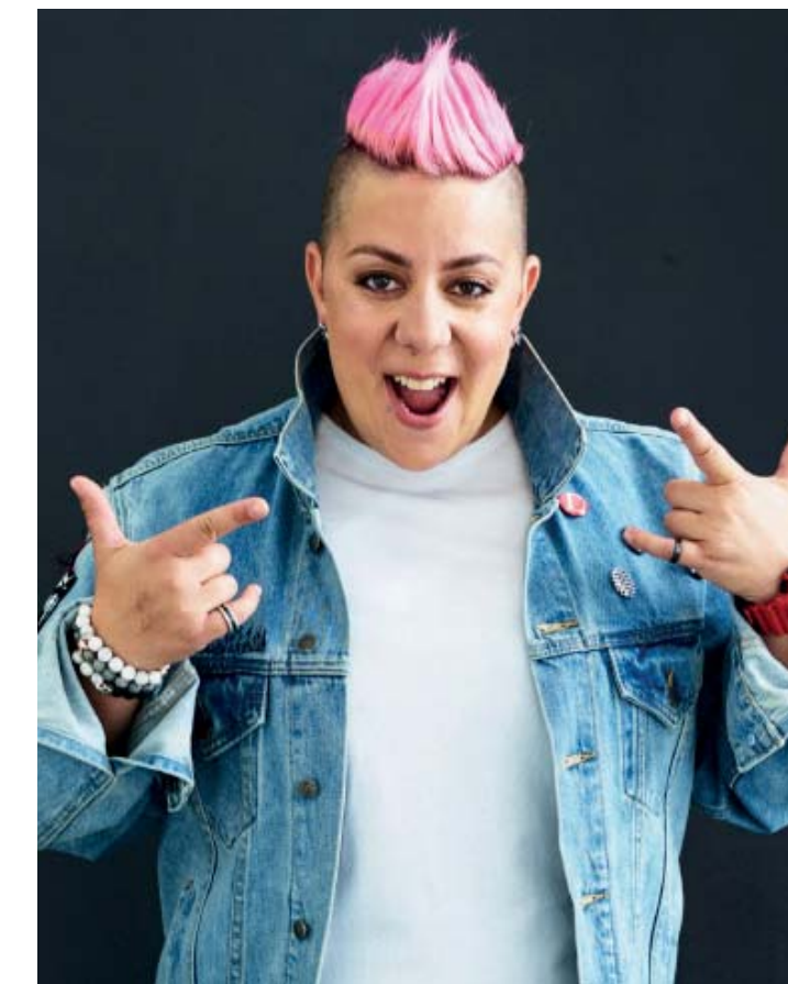
ANNA POLYVIYOU The Punk Princess of Pastry 📷 209K | 📺 45K