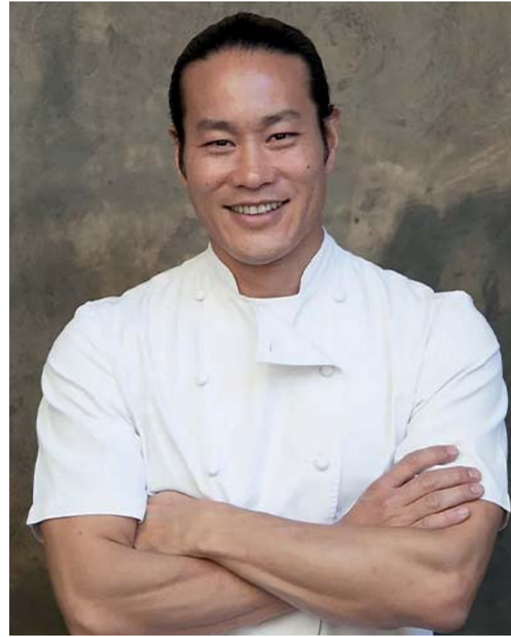
JUN TANAKA Michelin Starred Chef @ 13.7K | 📧 8.3K