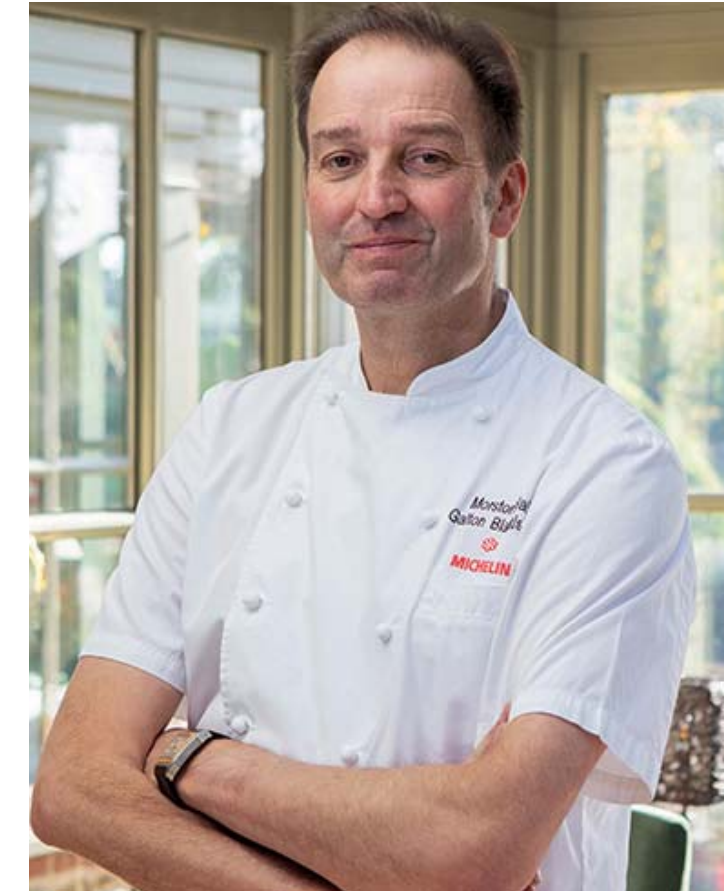
GALTON BLACKISTON Michelin Starred Chef @28.7K