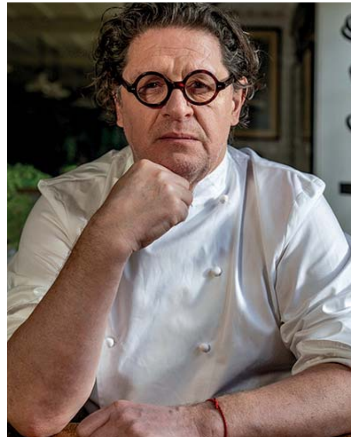
MARCO PIERRE WHITE First British chef to be awarded 3 Michelin Stars 📷 360K

We are frequently seen as the go-to management agency of choice for experienced chefs and exceptional talent looking for representation. We are also a firm favourite for clients in search of the perfect chef for their event, partnership, or collaboration.