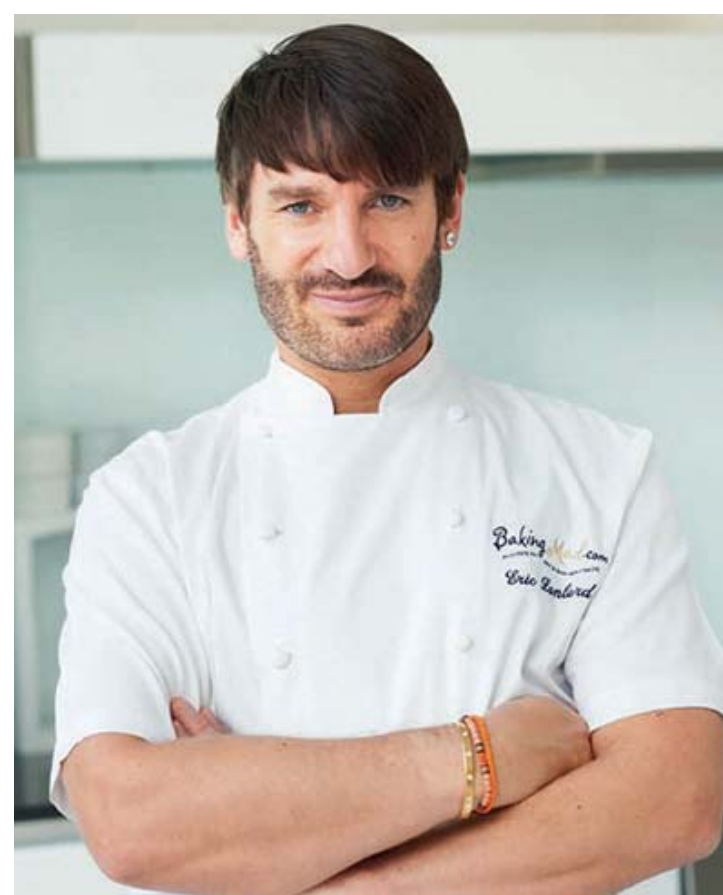
ERIC LANLARD World Renowned Chef @113K | 111.4K