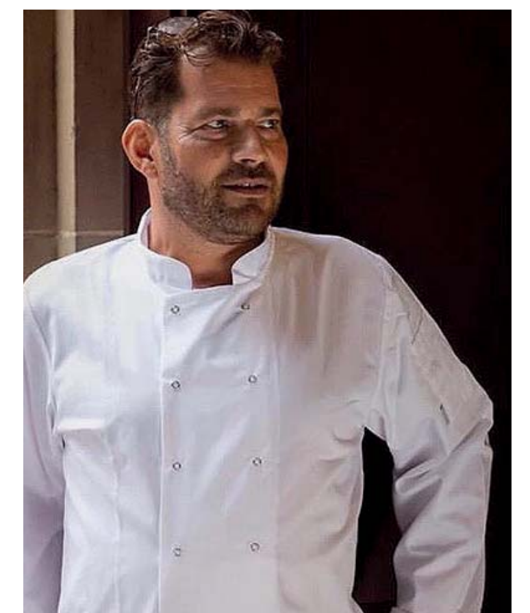
ED BAINES Author, TV Presenter, Restaurateur @3.2K | 783 | 5.3K