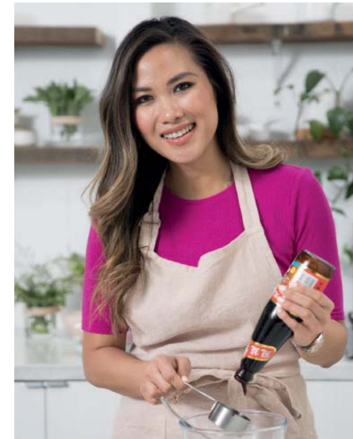
DIANA CHAN Masterchef Australia 📷 112K | 📺 31K