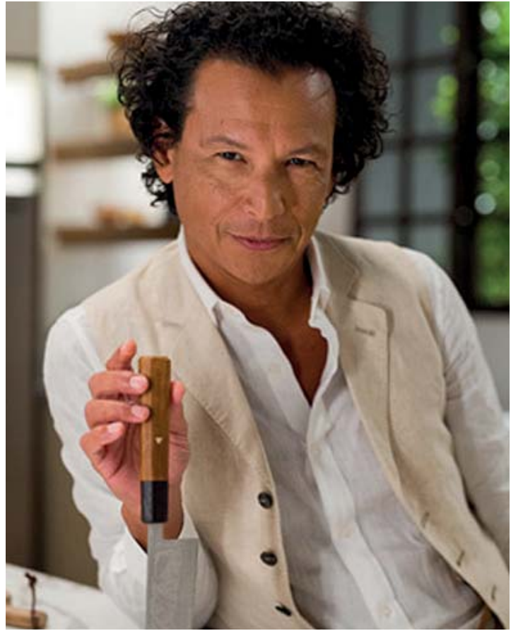
BOBBY CHINN Author, TV Personality, Restaurateur @197K | 13.4K