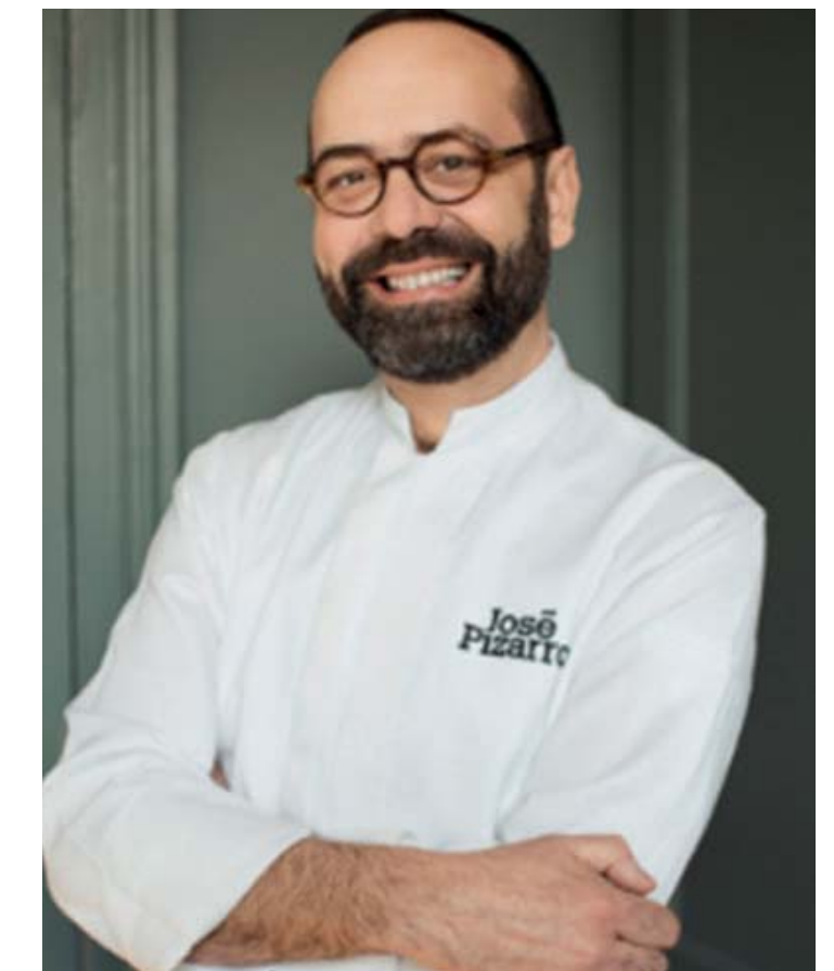
JOSÉ PIZARRO TV Chef & Restaurateur 📷 70K | 📺 2.8K | 📺 23.6K