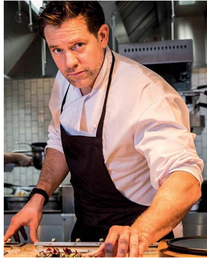
MATT TEBBUTT Well-known TV Chef @113K | 11K | 36.1K