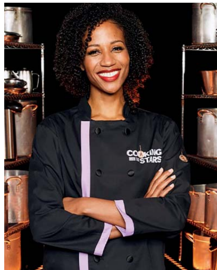
APRIL JACKSON TV Personality & Restaurateur @ 37K | 📧 2.1K | 📧 2.9K