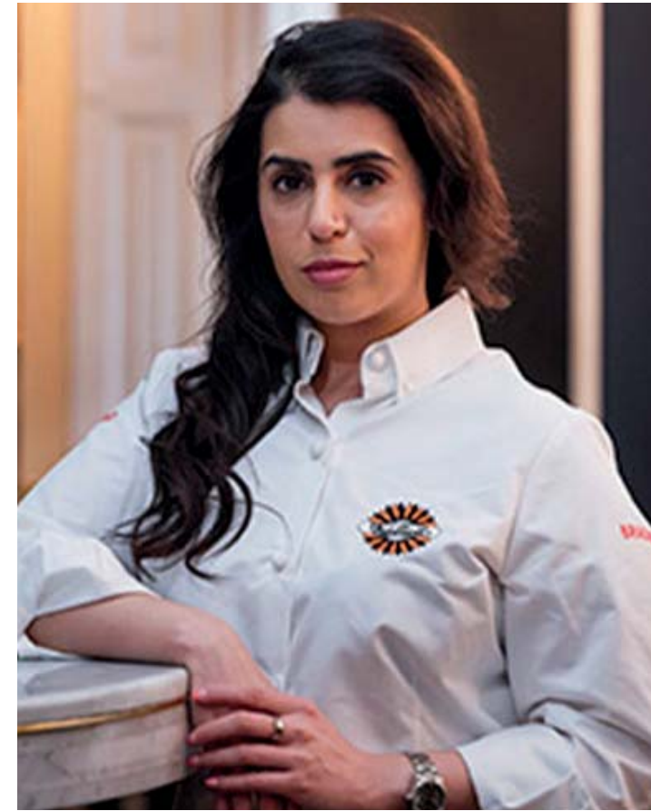
DIPNA ANAND Restaurateur & TV Chef @ 56K | 📧 7.4K | 📧 5.5K