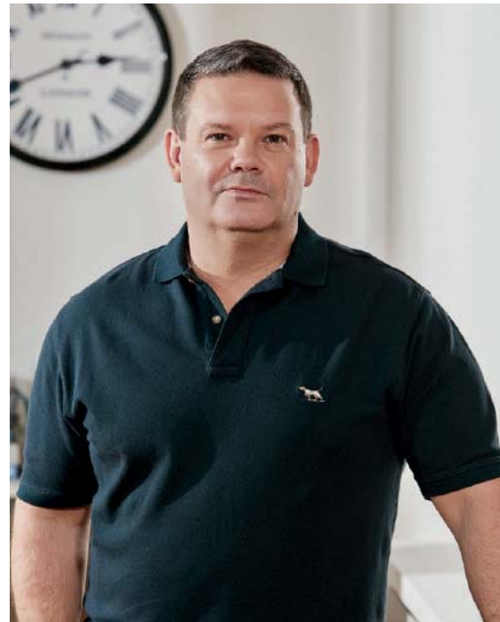
GARY MEHIGAN Masterchef Australia 📷 512K | 📺 252K