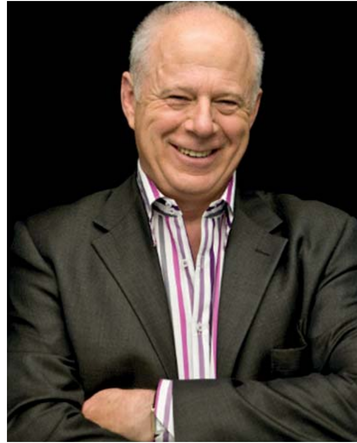
MATTHEW FORT Food Critic, TV Presenter & Author @ 5.6K | 📧 39.6K