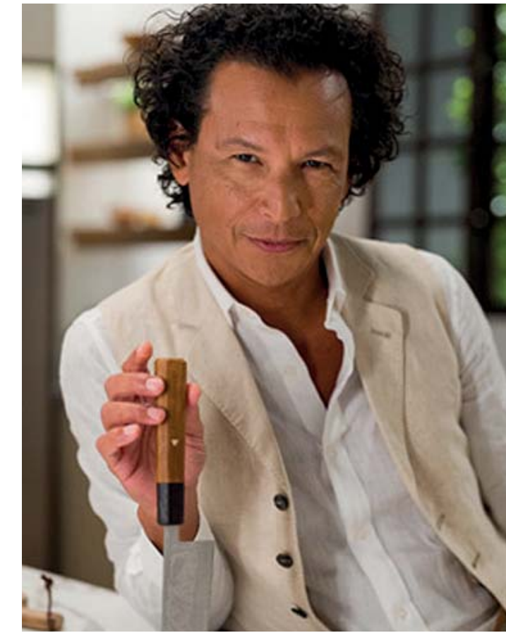
BOBBY CHINN Author, TV Personality, Restaurateur 📷 119K | 📧 13.4K