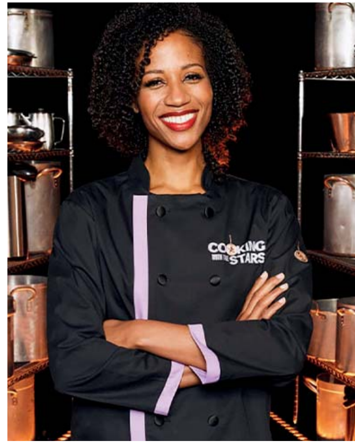
APRIL JACKSON TV Personality & Restaurateur 📷 32K | 📺 2.1K | 📧 2.9K