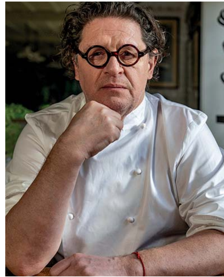
MARCO PIERRE WHITE World Renowned Chef 📷 339K

We are frequently seen as the go-to management agency of choice for experienced chefs and exceptional talent looking for representation. We are also a firm favourite for clients in search of the perfect chef for their event, partnership, or collaboration.