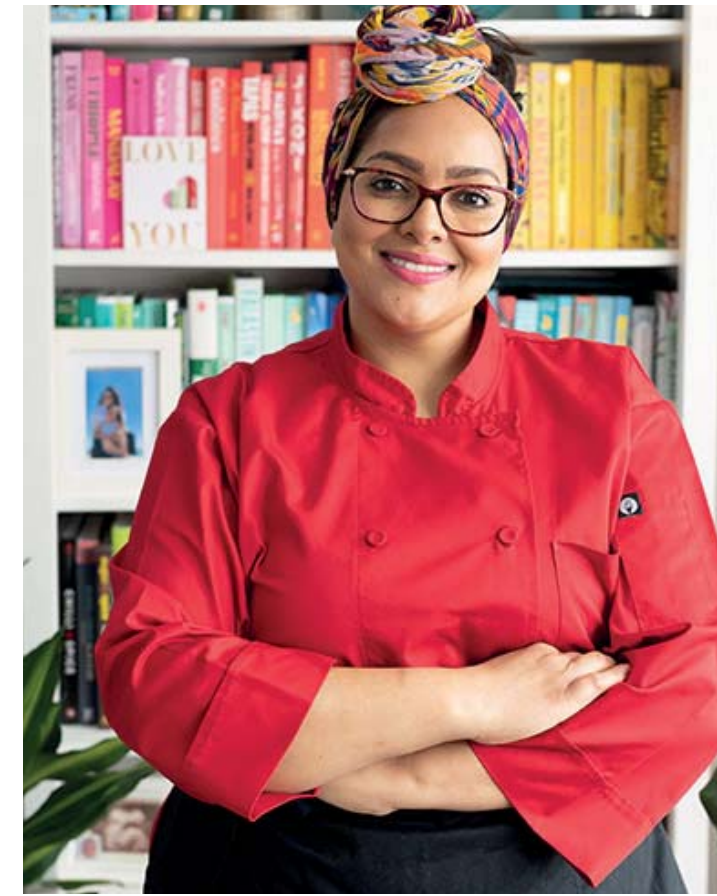
SHELINA PERMALLOO TV Chef, Author, Winner of MasterChef 📷 317K | 📺 117.3K | 📧 25.7K