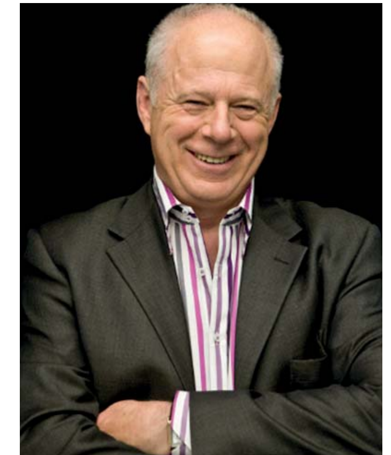
MATTHEW FORT Food Critic, TV Presenter & Author 📷 5.6K | 📧 39.6K