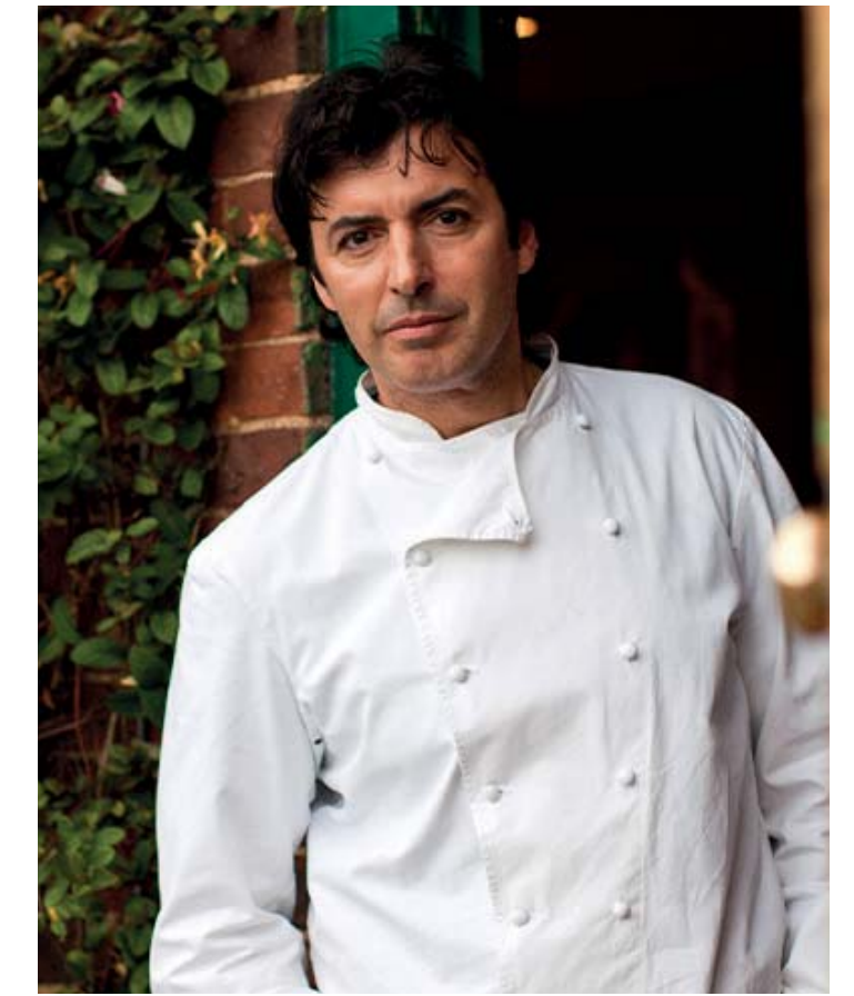
JEAN CHRISTOPHE NOVELLI Michelin Starred Chef 📷 31.2K | 📺 6.7K | 📧 13.7K