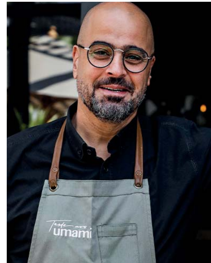
TAREK IBRAHIM TV Personality, Restaurateur 📷 109K | 📧 2.4K