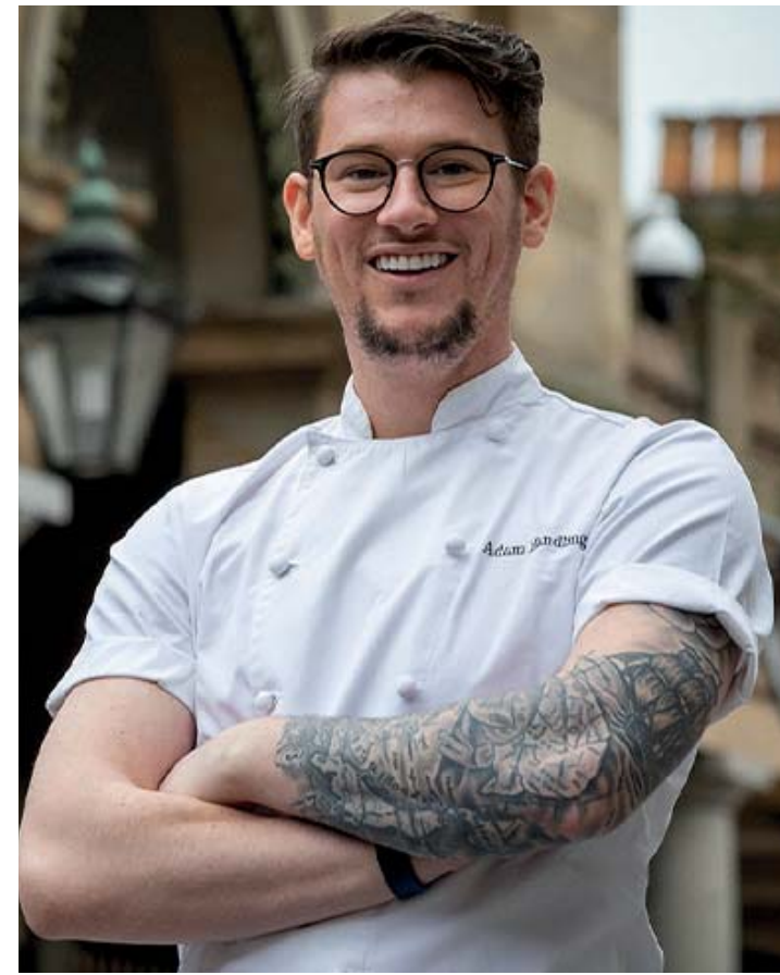
ADAM HANDLING Michelin Starred Chef 📷 107K | 📺 10K | 📧 18.5K