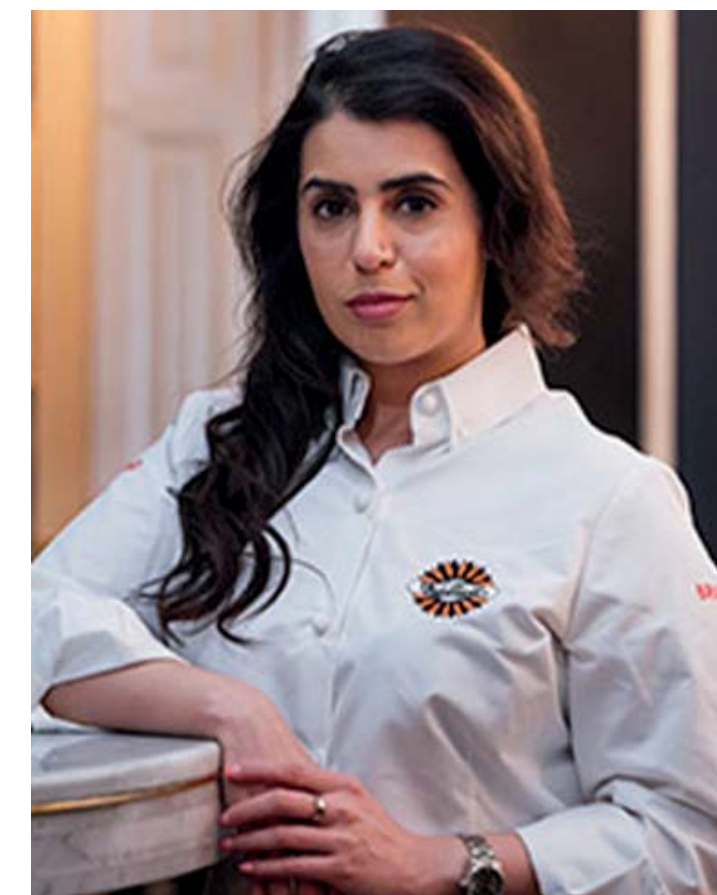
DIPNA ANAND Restaurateur & TV Chef 📷 56.7K | 📺 7.4K | 📧 5.5K