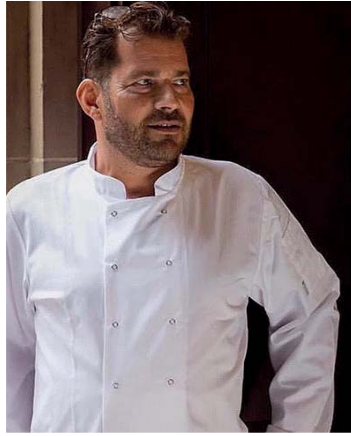
ED BAINES Author, TV Presenter, Restaurateur 📷 3.2K | 📺 783 | 📧 5.3K